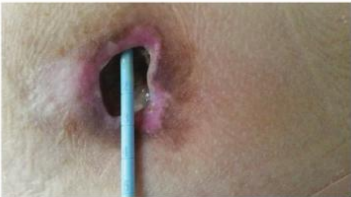
Above picture taken 17/12/15, right hip