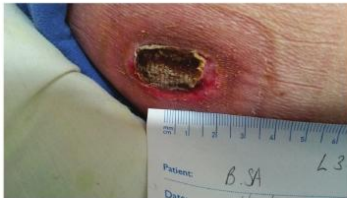
Right shoulder wound, 24.2.16